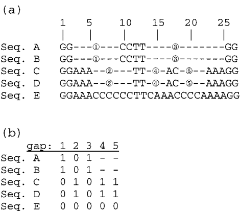
FIGURE 1. Example of simple gap coding. (a) Alignment. Circled no. 1 = gap 1 from positions 3 to 9; circled no. 2 = gap 2 from positions 6 to 11; circled no. 3 = gap 3 from positions 14 to 25; circled no. 4 = gap 4 from positions 14 to 16; circled no. 5 = gap 5 from positions 19 to 22. (b) Gap characters in data matrix. "0" = gap absent, "1" = gap present, "-" = inapplicable.

If sequences with longer, completely overlapping gaps were not coded as inapplicable for the subset gap, these longer, completely overlapping gaps would in effect be coded as homologous to bases in other sequences that do not have gaps in this region. Using the example above, suppose that sequence E is ancestral to sequence C, which is ancestral to sequence A (Fig. 2a). If the inapplicability rule is not used, the coding for absence/presence of gaps 3, 4, and 5 is as follows: sequence E 0,0,0; sequence C 0, 1,1; sequence A 1,0,0 (Fig. 2b). For gaps 3, 4, and 5 we recognize that the minimum number of steps from sequence E to sequence C is two (two deletions), and from sequence C to sequence A is one (a third "superimposed" deletion). However, this coding results in five steps: two steps from sequence E to sequence C, and three steps from sequence C to sequence A. The reason for this is that the 10-bp gap in sequence A is treated as homologous to the contiguous bases in sequence E for gap 4. However, there is no basis with which to make this homology assessment